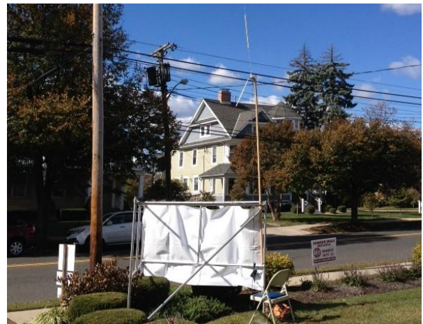
This was the operating position at rest area three which was the Methodist Church on Broad Street in Red Bank and staffed by Len, WA1PCY. You can see Len's folding chair and Yaesu HT (tiny black object) hanging from one of the bars.