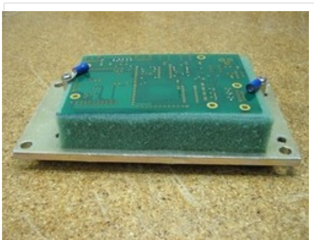
The W2IOG PCB holder in action, keeping components in place for soldering.

Here's a simple fixture that makes assembling small PC boards a snap. A scrap piece of 1/4 inch aluminum sheet forms a base for the fixture. Mount two 1-inch standoffs about 1/2 inch farther apart than the longest dimension of the PC board to be assembled. Now cut a piece of 1 inch thick soft foam packing material to slightly larger than the