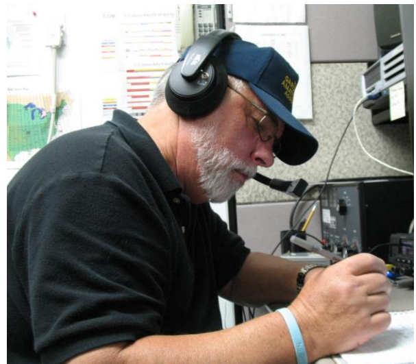
Art, N2AJ0 operating the GOTA station.